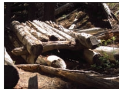
Historic bear-trap near Redfish Lake

The SA continues to promote cultural and natural history education along with preservation of local historic structures. Our growing oral history collection and our collection of photographic history are among our finest assets. We have applied for several grants aimed at archiving, preserving and making these treasures more available for use and enjoyment of scholars and our members and visitors.