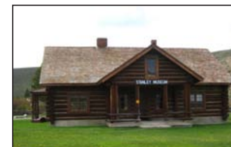
The Stanley Museum