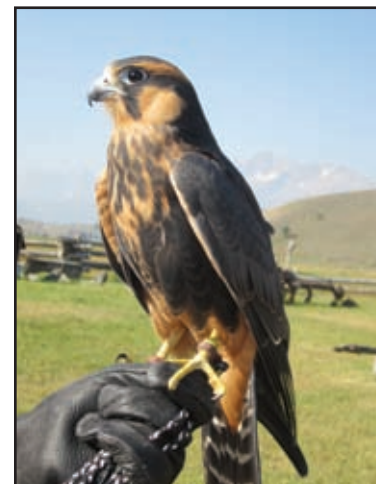
Live Raptors at the Museum

The fifth annual Sawtooth Forum and Lecture Series featured a wide range of topics affecting the Sawtooth - Salmon River Country. Over 850 people attended nine programs each at the Museum, and the Redfish Center. Programs ranged from live birds of prey, bears, wolverines, and white bark pine, to Shoshone legends, nineteenth century scientific excursions in the Sawtooth mountains, Salmon, mining history, and even a presentation on the Halstead fire and fire ecology from the National fire team assigned to the fire. A special feature this year was the addition of members only hikes and walks with the presenters on the Saturday after the lectures. The lectures are presented every Friday night, one at 5 PM at the Stanley Museum and one at 8 PM at the Redfish Center.