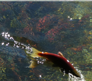
Kokanee spawning in Fishhook Creek.

Our summer naturalist and museum team were exceptional this year and all are to be commended for their efforts and contributions to make our season something special under trying times. The personal touches made by our team enhanced the Sawtooth experience for many coming to the mountains this summer.