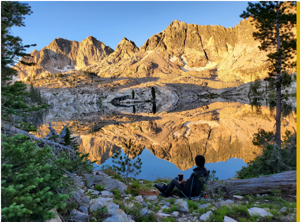
PEOPLE IN NATURE

"Morning Coffee with a View" Tonia McCrary