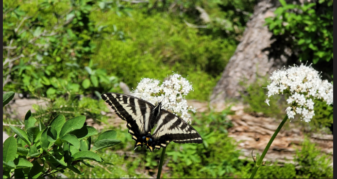
"Butterfly" Angelyna Sentirmay